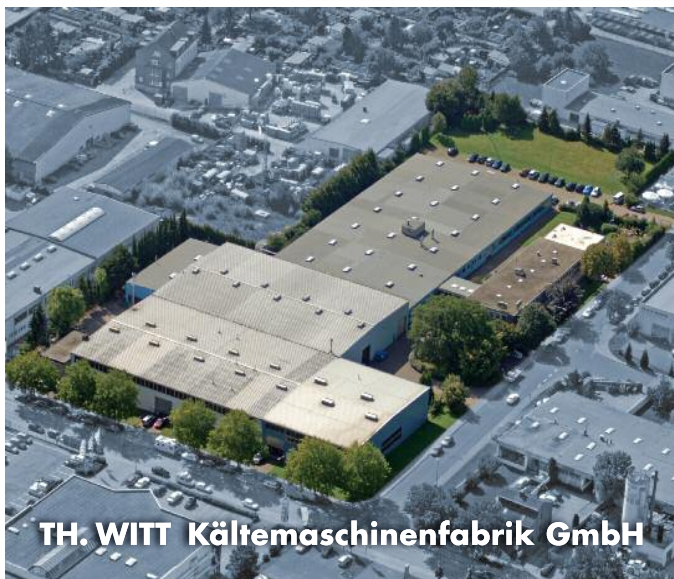
TH. WITT Kältemaschinenfabrik GmbH